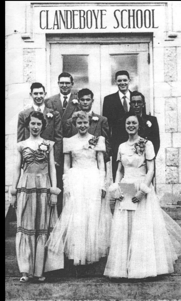
Graduating Class of 1953